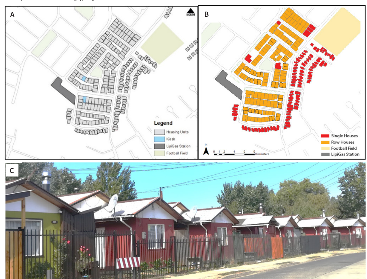
Figure 5 Diversity of land use and housing typologies in Reina Sofia