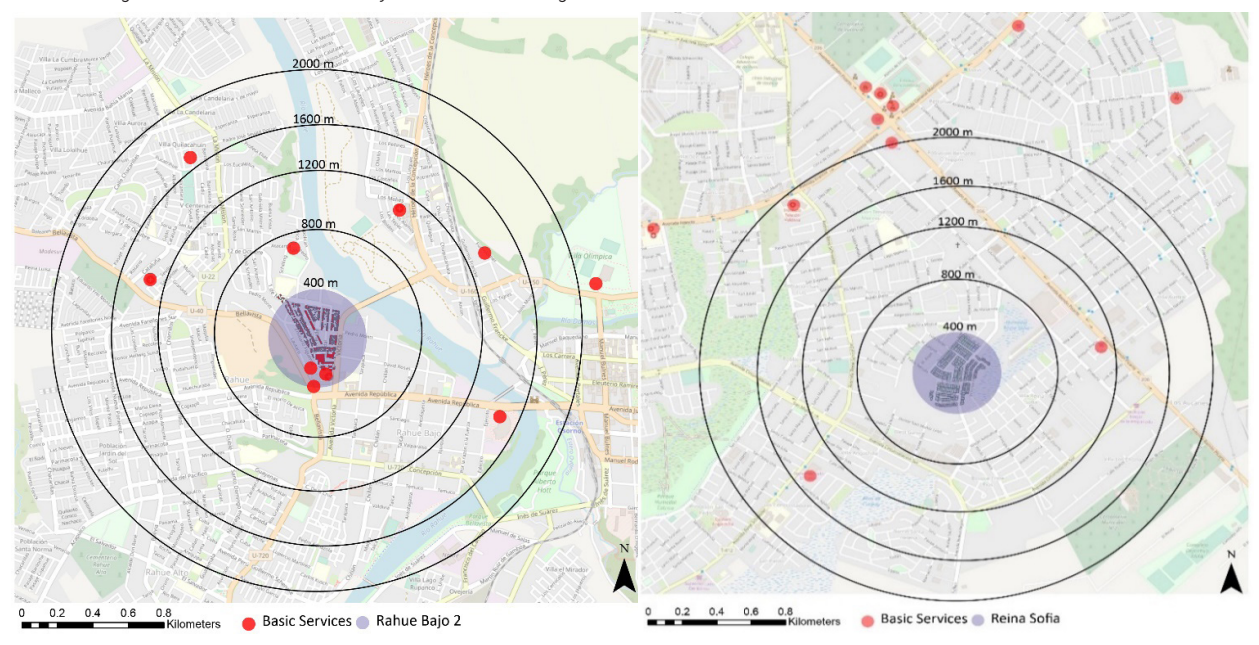
Figure 3 Radius showing distance of walkable accessibility to services in each neighbourhood

in which pedestrian access to daily life needs can be observed. Here, in practice can be understood what Talen (2011) explains as walkable access to services as an essential part of the sustainability equation, where people living in well-serviced locations will tend to have lower carbon emissions, and higher access to opportunities, lower the transport costs.