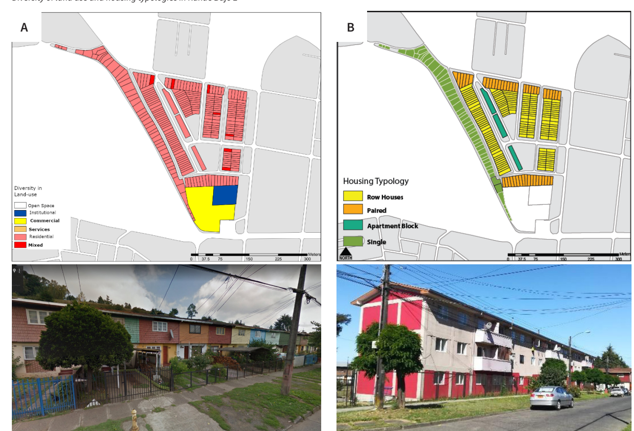
Figure 4 Diversity of land use and housing typologies in Rahue Bajo 2